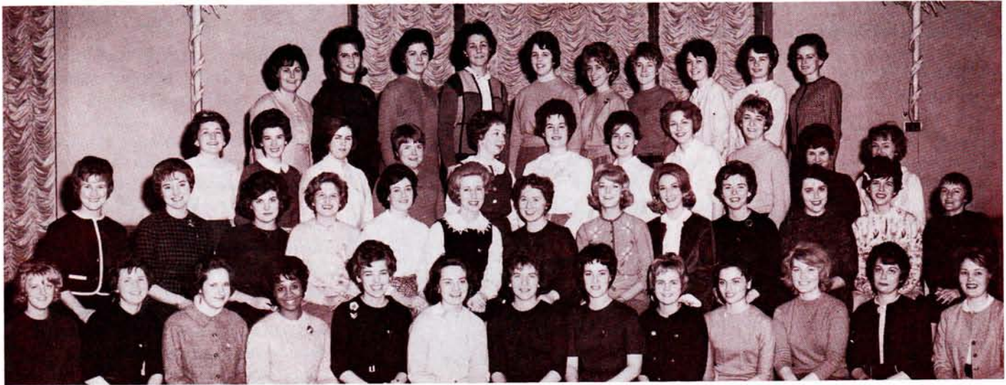
The active members of Upsilon Chapter of Theta Phi Alpha at the time of Upsilon's Twentieth Anniversary in March, 1963.