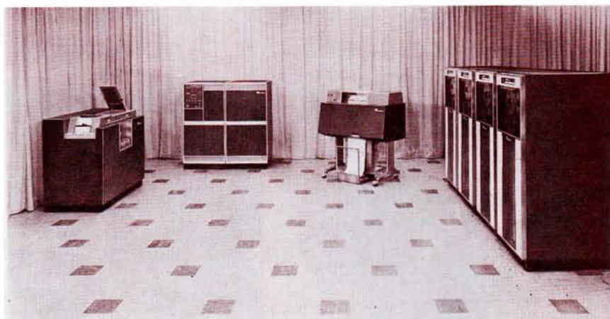
THIS IS THETA PHI ALPHA'S MECHANICAL MAID. The four seemingly separate machines are connected by under-the-floor cables. On the left is an IBM punch-card reader; next is the central control unit; then comes the printer; and on the right are the magnetic tape units.

You will notice, too, that after your name a number appears. This is your new Theta Phi Alpha identification number. The first three digits represent your chapter, and the other four are your individual identification within that chapter. (In the future, when you send address changes to National Office, it will help if you will