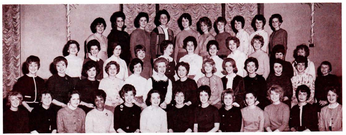
The active members of Upsilon Chapter of Theta Phi Alpha at the time of Upsilon's Twentieth Anniversary in March, 1963.