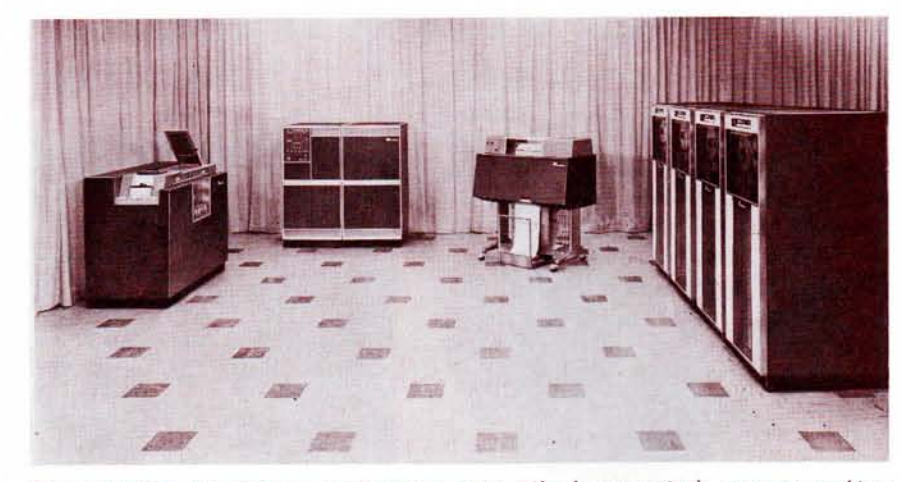
THIS IS THETA PHI ALPHA'S MECHANICAL MAID. The four seemingly separate machines are connected by under-the-floor cables. On the left is an IBM punch-card reader; next is the central control unit; then comes the printer; and on the right are the magnetic tape units.

You will notice, too, that after your name a number appears. This is your new Theta Phi Alpha identification number. The first three digits represent your chapter, and the other four are your individual identification within that chapter. (In the future, when you send address changes to National Office, it will help if you will